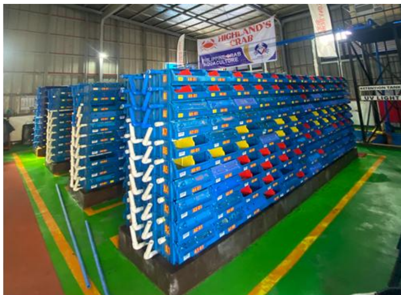
Figure 1. Mangrove crab fattening in vertical recirculating aquaculture system of Philippine Crab Aquaculture in Alfonso, Cavite, Philippines.

Descriptive statistics, including frequencies and percentages, were used to summarize the survey responses. The precision of each estimated proportion was assessed by calculating the corresponding 95% Wald confidence interval (%).