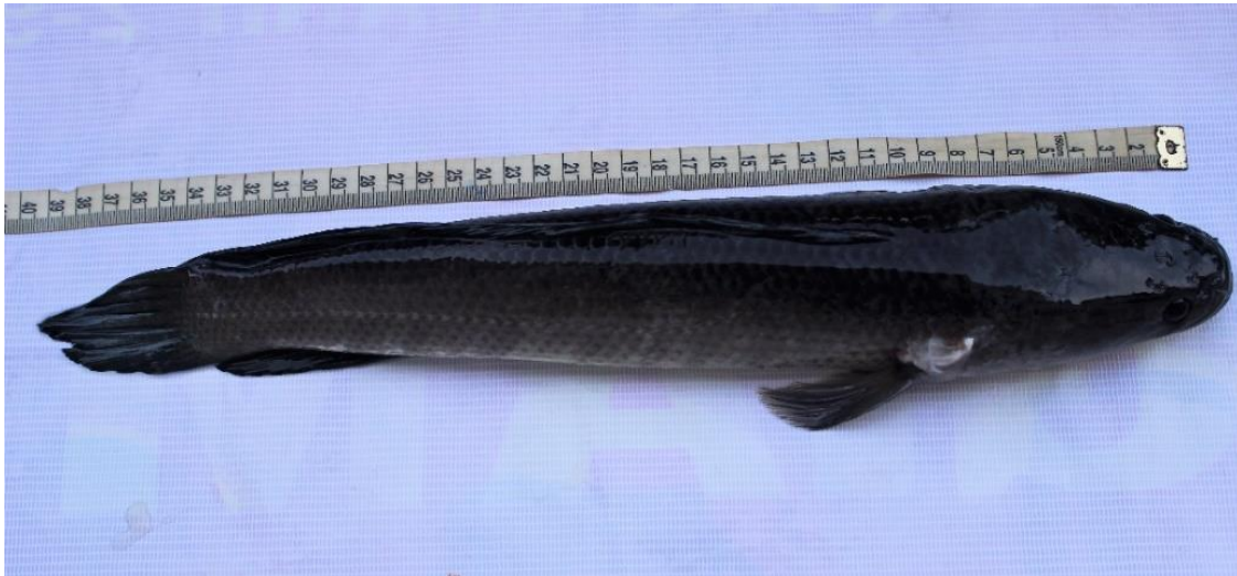
Figure 1. Fundamental morphology of farmed Channa striata (Bloch, 1793) (source: the authors).

Morphological characteristics of snakehead fish. The results of the fundamental morphological characteristics of striped snakehead fish cultured in four regions of the Mekong Delta are displayed in Figure 1.