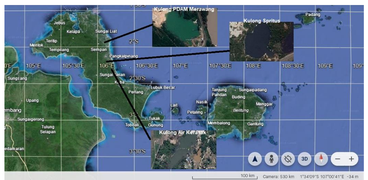
Figure 1. Research site locations (source: processed, 2023).

Baturusa Cerucuk Pangkalpinang, periodic satellite images from Google Earth, and Digital Elevation Model (DEM) data from USGS.